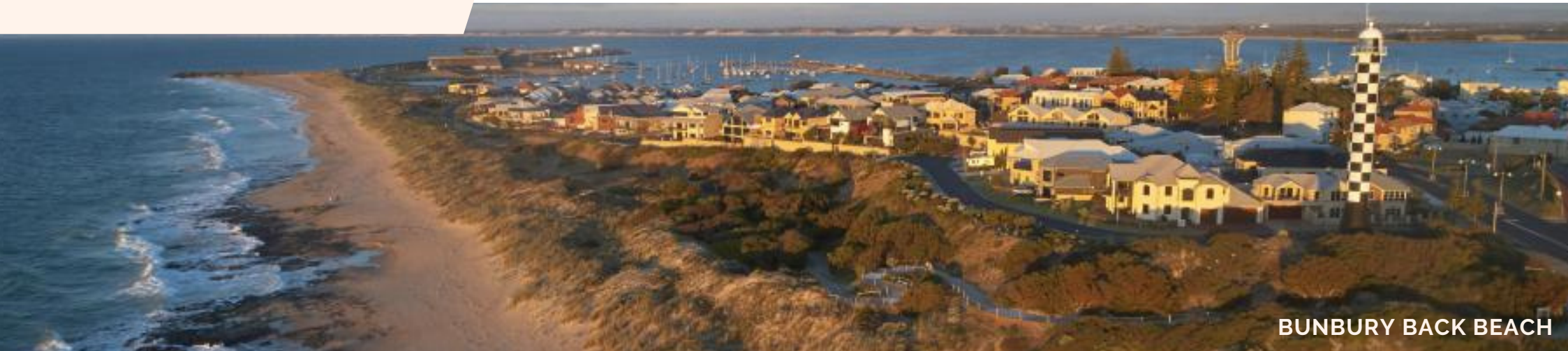
BUNBURY BACK BEACH

“ I feel the course really helped develop my musicianship skills as well as giving me a solid understanding of how to effectively teach different concepts